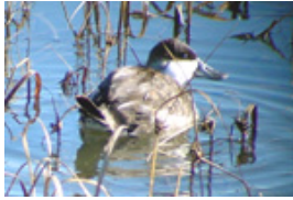
Ruddy Duck, winter plumage